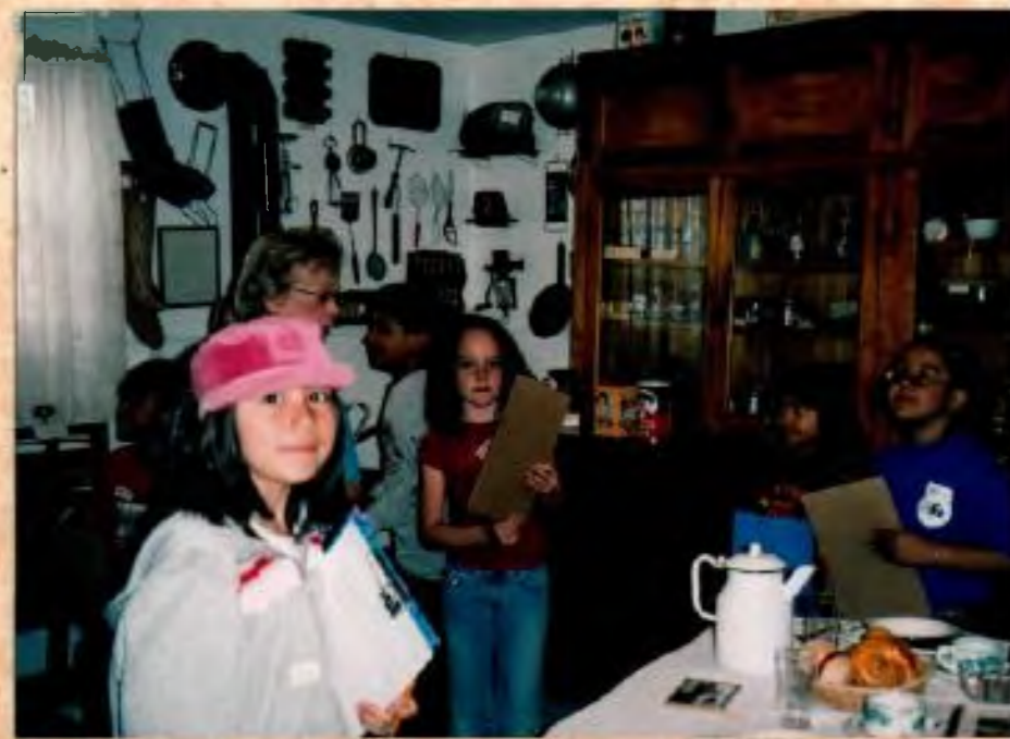
BEVERLY W. WHITMAN ELEMENTARY SCHOOL 2 ND GRADERS