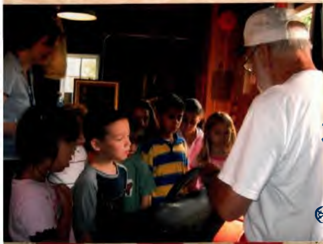
WEDGE HANCOCK & TARKINGTON ELEMENTARY SCHOOL 2 ND GRADERS