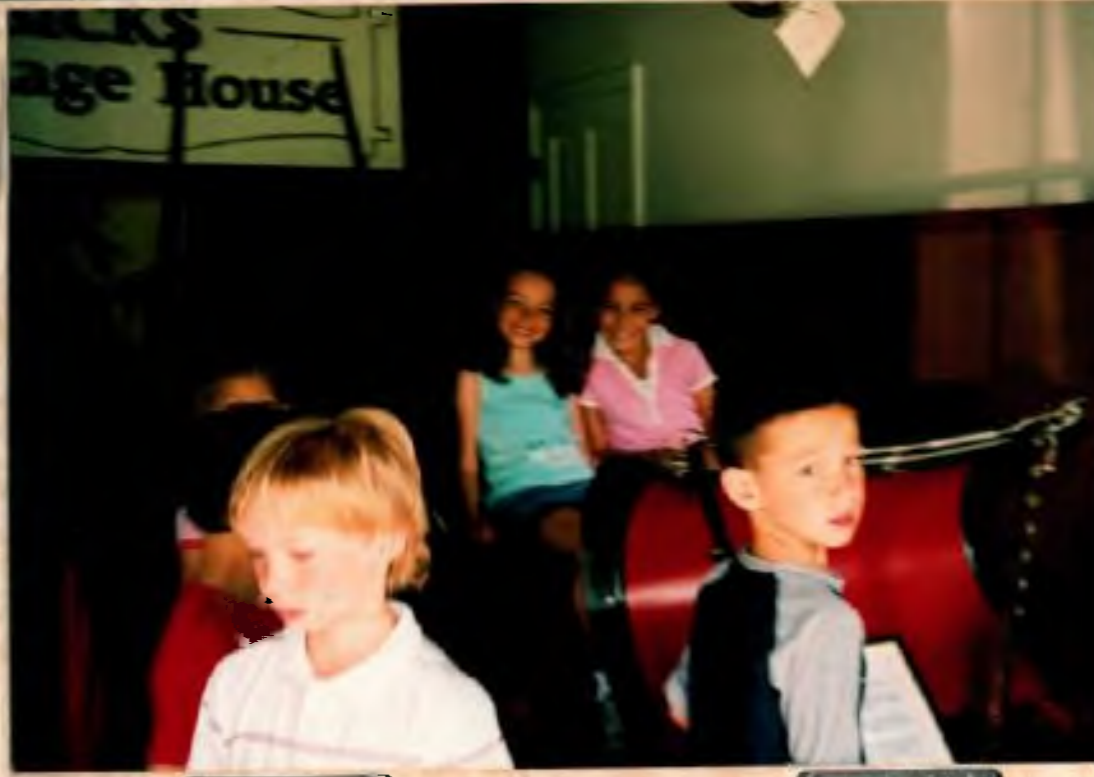
TARKINGTON ELEMENTARY SCHOOL 2 ND GRADE FIELD TRIP