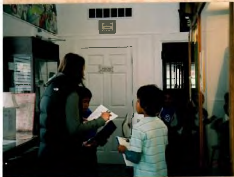
WHITMAN ELEMENTARY SCHOOL 2 ND GRADE FIELD TRIP