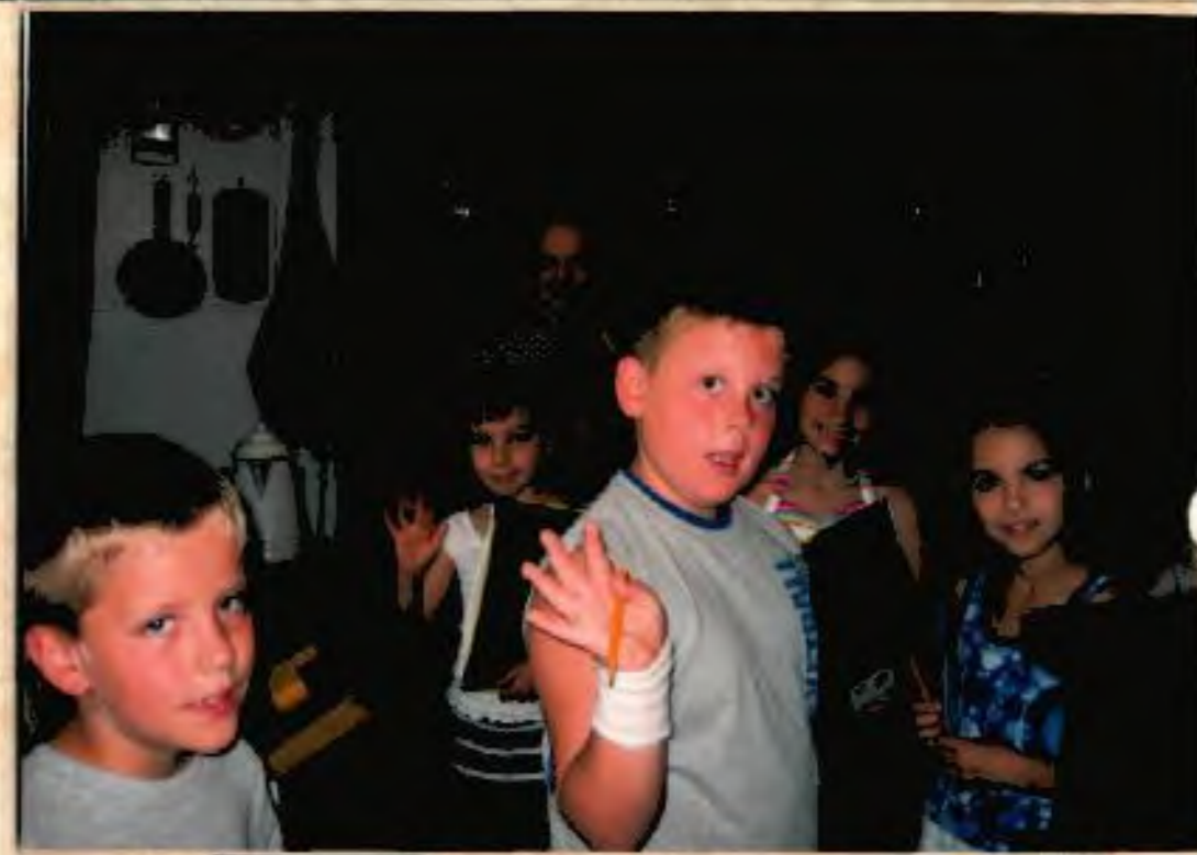
TARKINGTON ELEMENTARY SCHOOL 2 ND GRADE FIELD TRIP