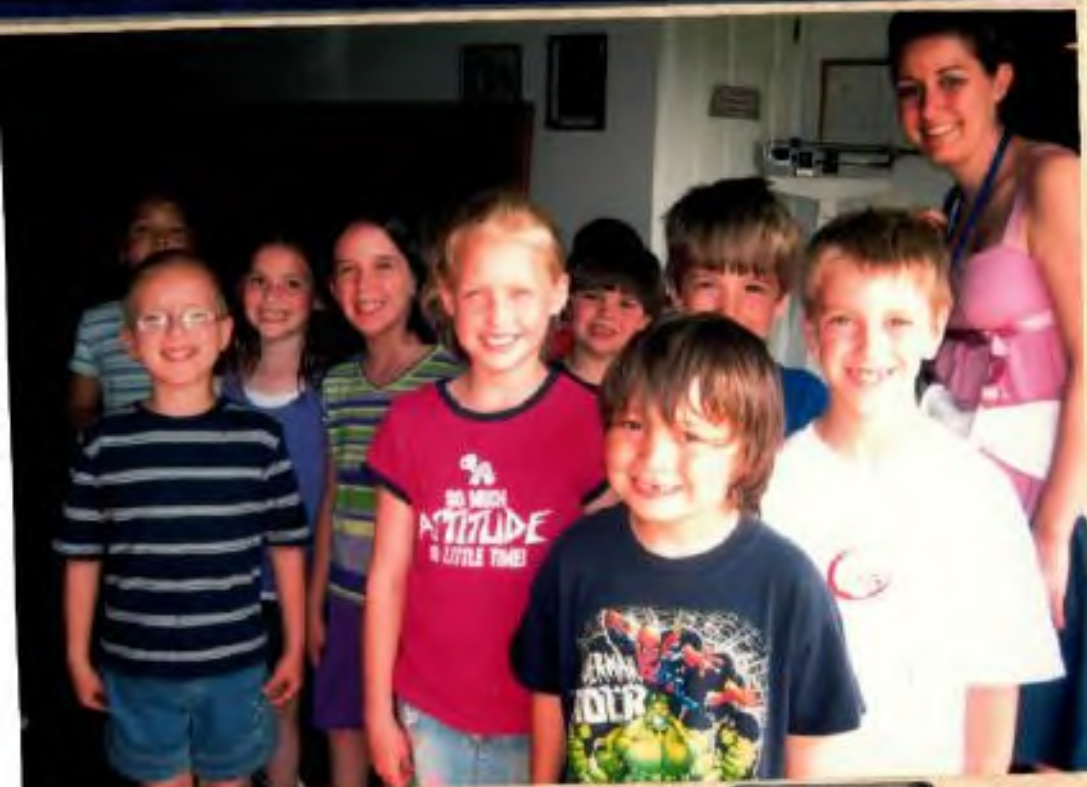
TARKINGTON ELEMENTARY SCHOOL 2 ND GRADE FIELD TRIP