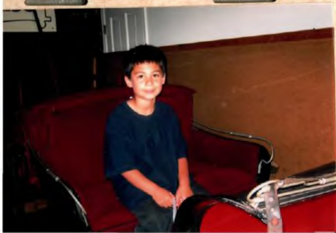
TARKINGTON ELEMENTARY SCHOOL 2 ND GRADE FIELD TRIP