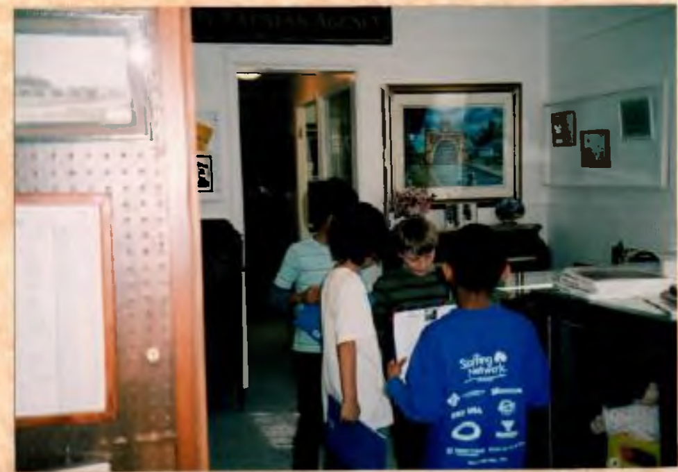
WHITMAN ELEMENTARY SCHOOL 2 ND GRADE FIELD TRIP