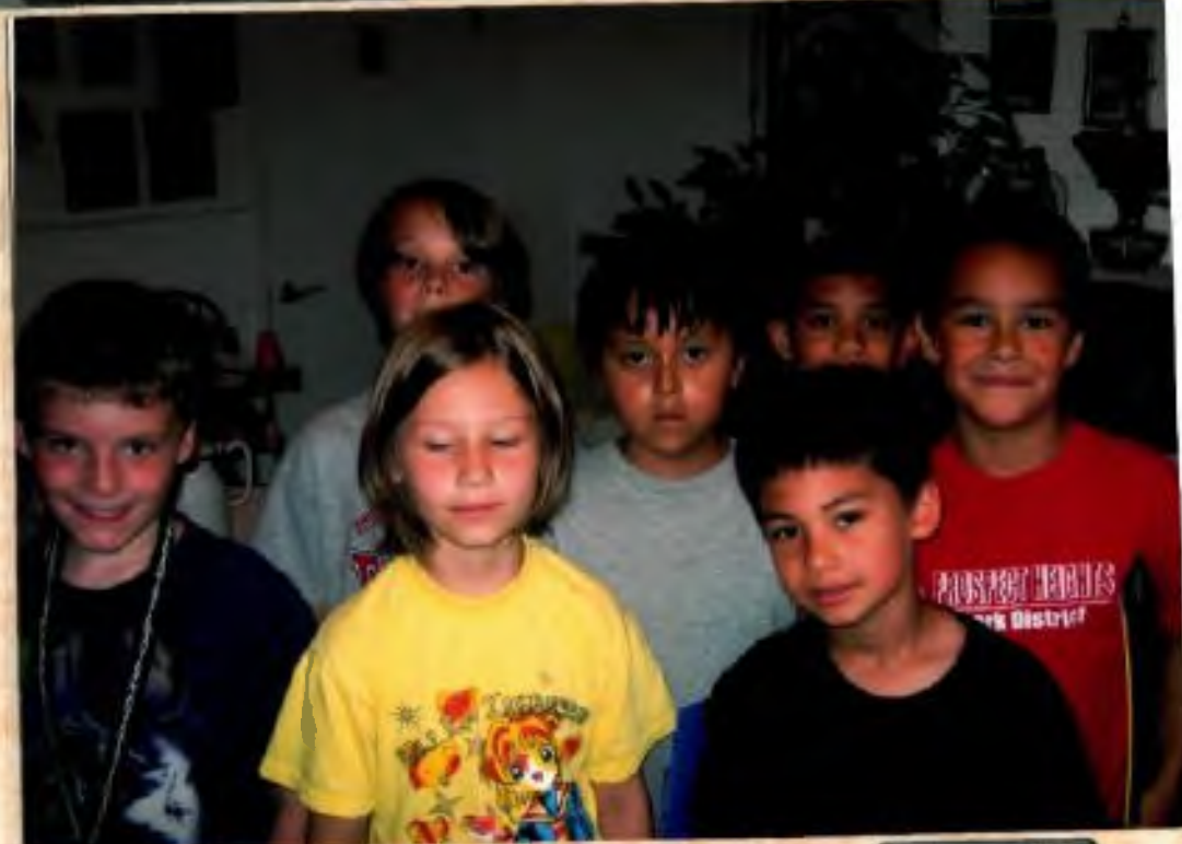
TARKINGTON ELEMENTARY SCHOOL 2 ND GRADE FIELD TRIP