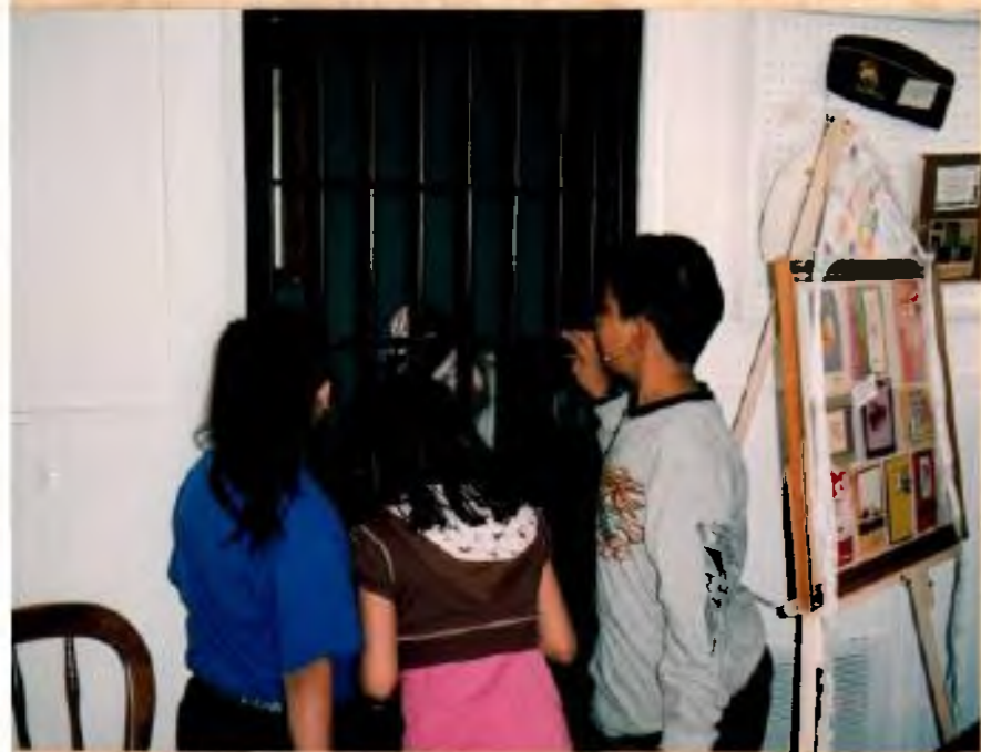
WHITMAN ELEMENTARY SCHOOL 2 ND GRADE FIELD TRIP