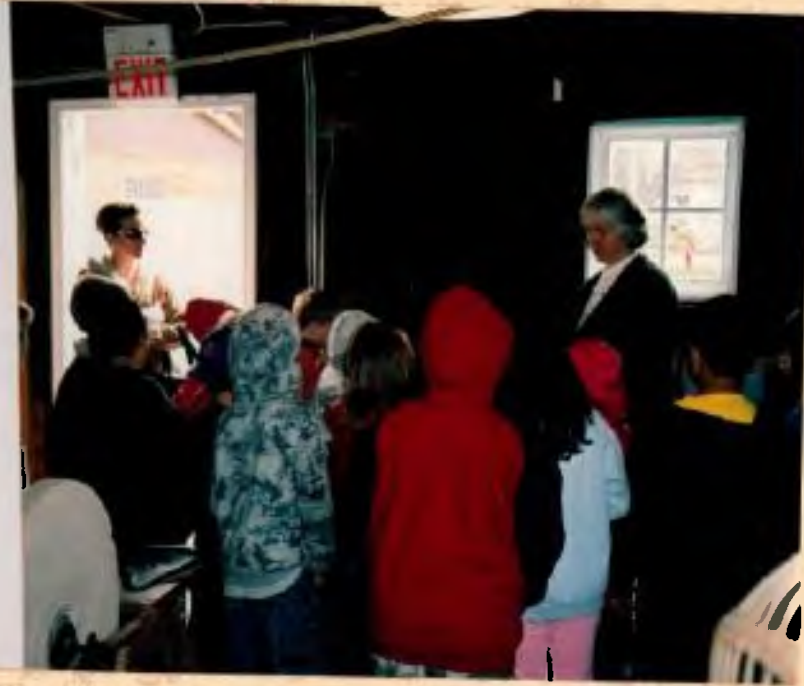
Whitman School Field Trip 2nd grade May 8, 2008